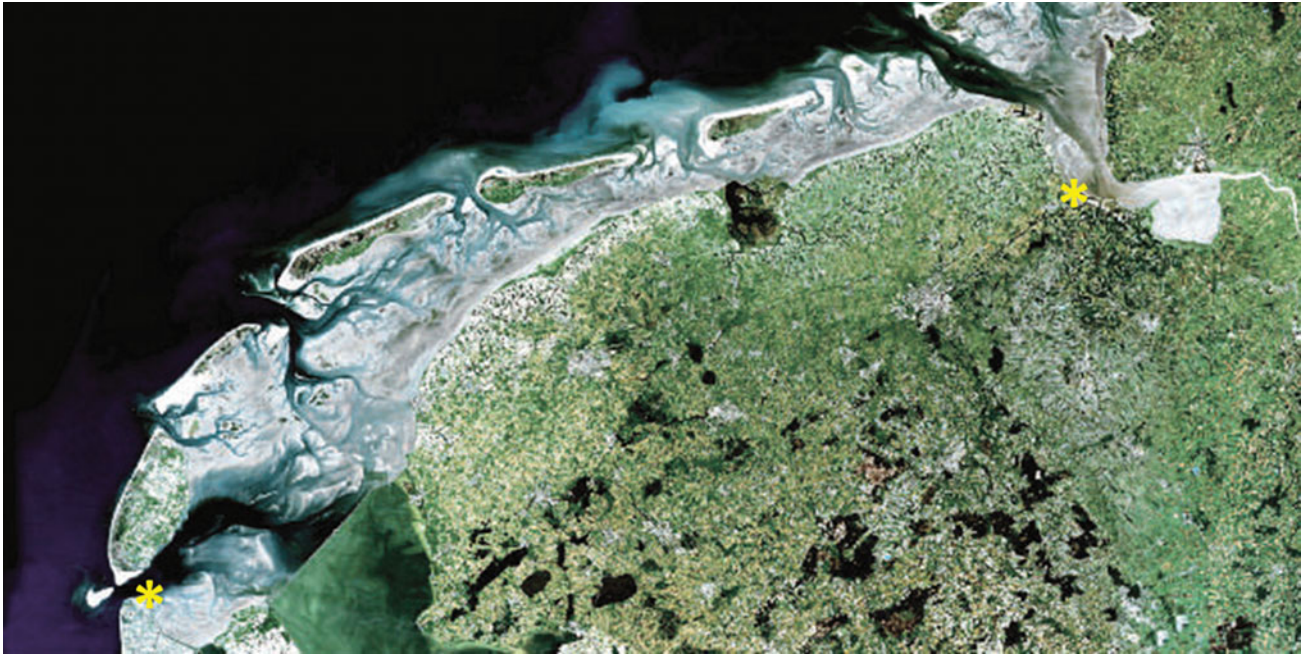
Fig. 1. Overview of the Dutch Wadden Sea. The locations of the tide gauge stations Den Helder at the western boundary and Delfzijl at the eastern boundary are indicated with asterisks.

This synthesis summarizes the information presented in the papers by Vermeersen et al. (2018), Fokker et al. (2018) and Wang et al. (2018) in this special issue of the Netherlands Journal of Geosciences and combines projections of local sea level, subsidence and sediment transport into an assessment of the future state of the Dutch part of the Wadden Sea. We will restrict ourselves to projections of the future morphological development using the SLR scenarios presented by Vermeersen et al. (2018) in combination with the prognoses for subsidence caused by gas and salt extraction for the individual fields in the Wadden Sea by Fokker et al. (2018). In order to do this, the state of the sediment balance, as presented by Wang et al. (2018), for the years 2030, 2050 and 2100 will be discussed. The projection of the morphological state of the individual basins for these years will be based on existing system knowledge and insight rather than a new modelling study.