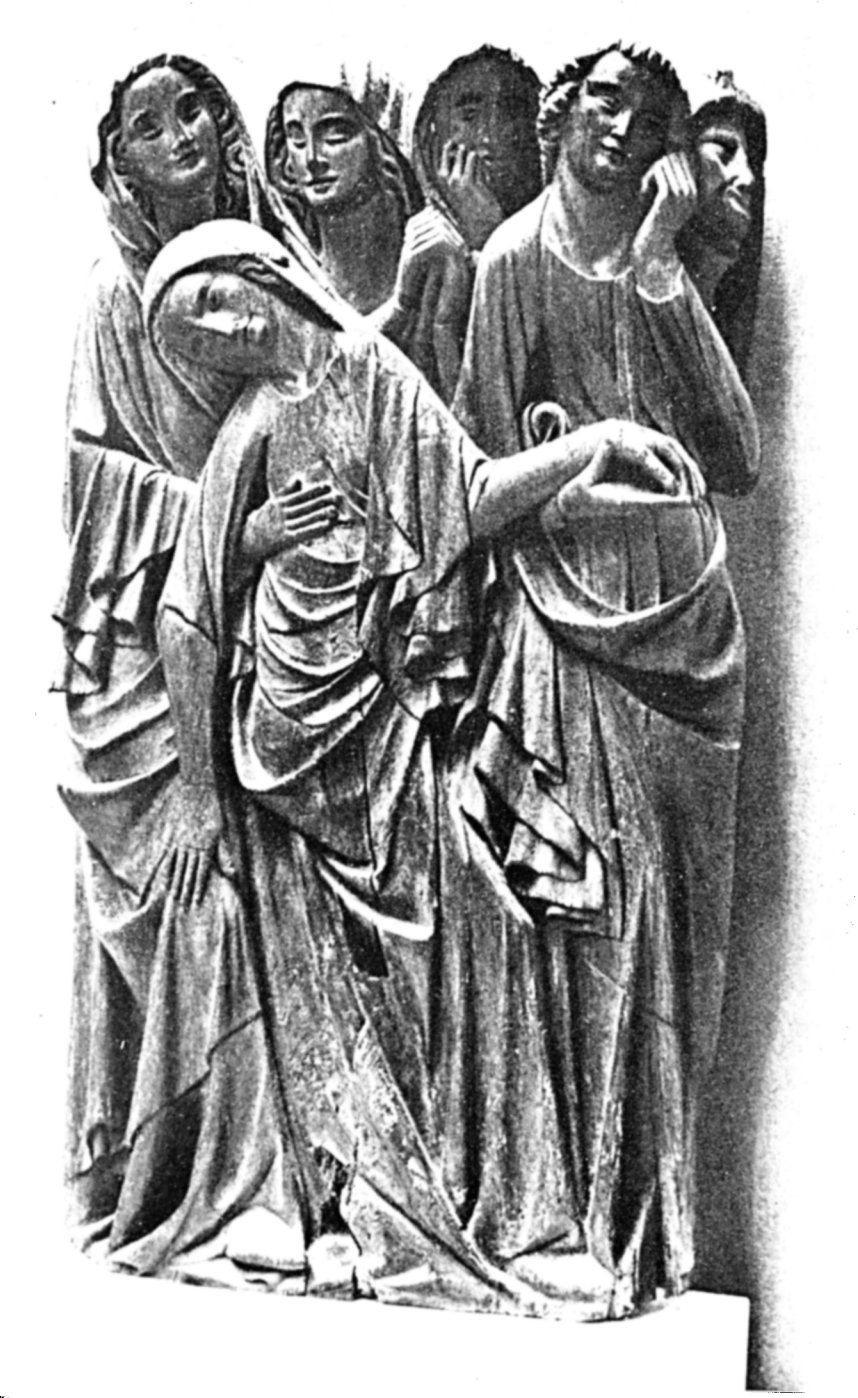
HE SWOONING OF THE VIRGIN