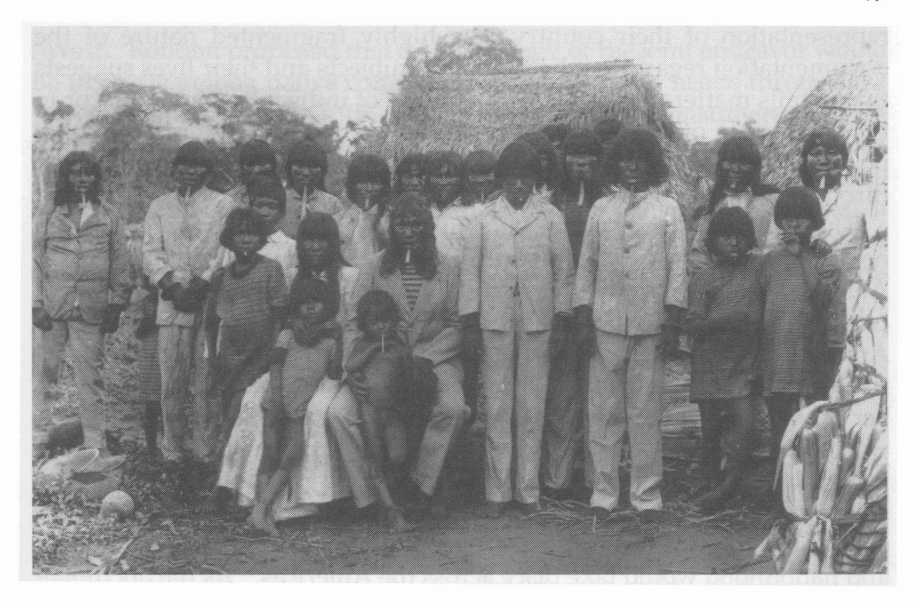
Figure 3 Community unidentified in SPI records (circa 1930).

meant the demarcation, takeover, and settlement of indigenous bodies, which were squeezed into uncomfortable clothes, national consciousness, and imaginary citizenship through a system of production and positivist propaganda that, at least in retrospect, evokes the slave labor that Brazil had officially abolished more than a half century earlier.