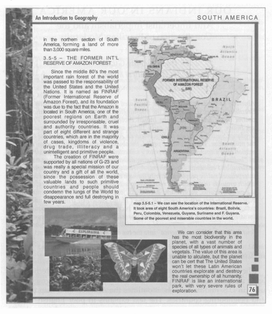
Figure 1 "An Introduction to Geography."

territory from the "irresponsible, cruel and authoritary [ sic ] countries" of Latin America by urging protection of the "world's lungs" and referring to the rainforest as patrimony "of all humanity."<sup>1</sup> Titled "A Amazônia é nossa!" this anonymous e-mail message led Internet users throughout the Americas to believe that U.S. schoolchildren have indeed been studying the "necessary" takeover of Brazilian territory and its conversion to