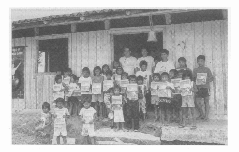
Figure 5 Students from São José dos Marabitanas receive Sivamzinho notebooks (1998).