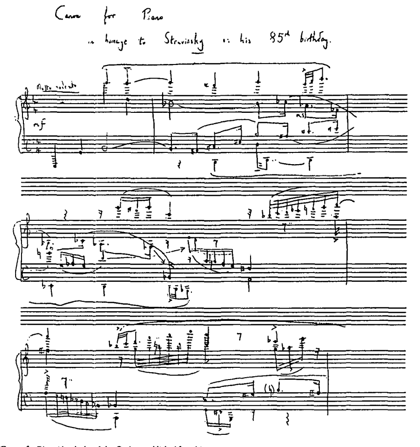
Part of 'Canon for Piano' by the late John Ogdon, published from his manuscript in Tempo 81.

(To be concluded. From the period described above, we retain back numbers for sale of Nos.66-73, 76, 77, 81, 83, 84 and 87-96, all of which retail at £1.80 plus postage with the exception of the Stravinsky 85th Birthday issue, No.81, which costs £6.00 plus postage. We can also supply photocopies of any issue no longer in stock, or any article from such issues, at a charge of 10p plus postage and VAT. A detailed listing of the principal contents of all issues since 1939 is available free from our editorial address by request.)