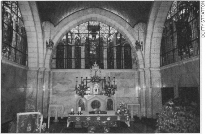
St. Anne's Church, located in the Muslim Quarter of Jerusalem, was built in 1140 and is noted today for its exceptional acoustics.

A professional exhibition of emergency and medical equipment will be held concurrently with the Congress.