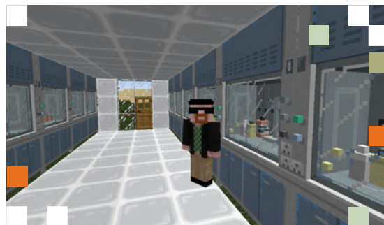
(Top) A flamethrower built in Polycraft World destroys some of the creatures bent on your destruction. (Bottom) Meeting a colleague in the corridor of a science building on the UT Dallas campus.

it, one of our thoughts was to implement synthesis on the molecular level where you could actually go in and build a molecule using elements," he says. "While this may not be the most scientifically relevant approach from a laboratory perspective, it would be scientifically relevant from an education perspective."