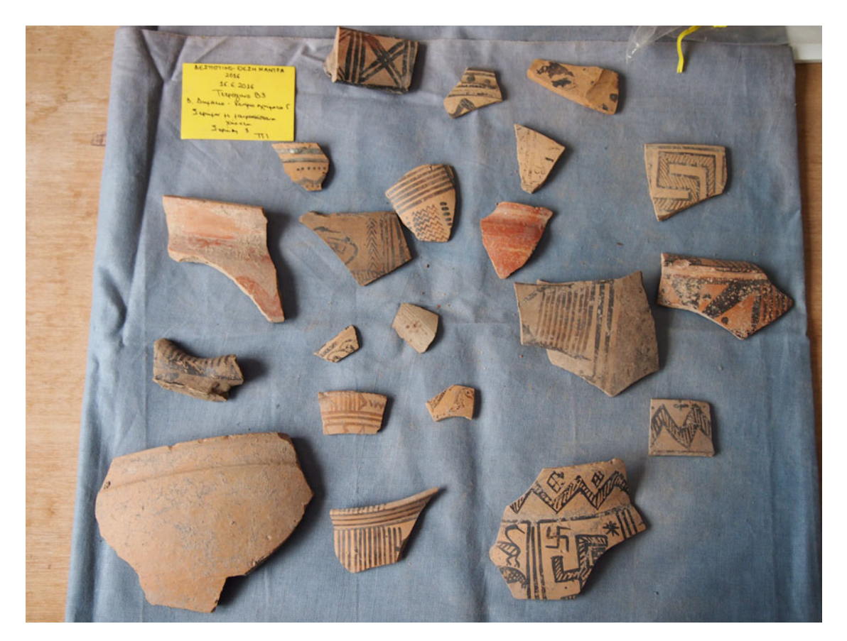
Fig. 11. Sherds of Geometric skyphoi and kantharoi from the deposition.

In all cases, the clay, metal, and other objects, as well as the zooarchaeological remains, have been removed from their original context, before being transformed into construction debris for the foundation of Building \Delta of the Archaic temenos in the second half of the sixth century.