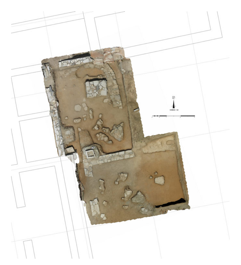
Fig. 10. Photogrammetric-architectural plan of the Early Iron Age buildings O & \Xi (G. Orestidis). Drawn representation (A. Zourbaki).

an olpe of the very end of the eighth century rested by the pithos at the north-west corner, while the other pithos contained bones.