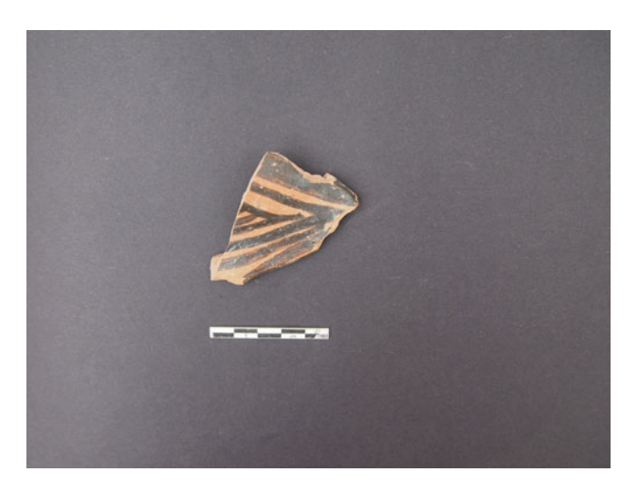
Fig. 4. Wing of terracotta bird.

1996, 62, pl. 13; Kourou 2005, 250, fig. 4) and the island of Naxos (Vlachopoulos 2006, vol. B, chapt. 9, no. 15) and date to the twelfth century BC. After a gap of slightly more than a century, bird askoi are attested on Crete and the Dodecanese from the ninth century onwards (Lemos 1994, 231, 234). The only bird vessel rather than askos from the Early Iron Age Cyclades comes from the Naxian necropolis of Tsikalario, and it has been dated to the Middle Geometric period (Charalambidou 2017, 378–9, fig. 12). The head and eye formation of the Despotiko figurine can be compared to Late Helladic IIIC examples (Kallithea Achaia: Guggisberg 1996, 62, no. 190, pl. 12.9; Amyklai: Guggisberg 1996, 57, no. 177, pl. 12:3) with which it shares the short neck. On the other hand, the elongated, almost cylindrical, beak is characteristic of the Protogeometric bird askoi with high, cylindrical neck from Crete and especially Knossos.<sup>20</sup>