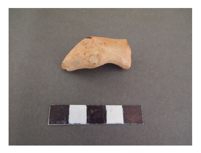
Fig. 8. Clay plastic snakehead.

Mandra of Despotiko is one of the few Cycladic sites where a concentration of figurines, rather than a few examples, is attested. The different types of terracotta animals attested at the site might be consistent with the enrichment of the figurine repertoire in the Aegean after the ninth century BC (Averett 2007, 240, 297), but their heterogeneity is exceptional for the Cyclades. Bovids might have been common at the time, but the snake is an extremely rare type; moreover, the idiosyncratic nature of the large birds is noteworthy too.