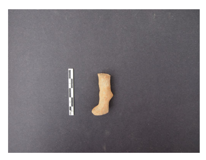
Fig. 2. Leg of terracotta bovid (author's photograph).