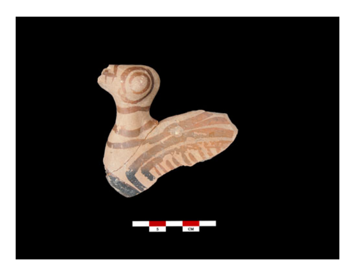
Fig. 3. Terracotta bird.

The hollow terracotta bird, recovered in two large parts, is made of a deep reddish brown rough fabric with a grey-black core, containing silver mica (Fig. 3). The figurine has a small head, distinctly rounded on top, and a beak of slightly oblong section, whose edge is missing.<sup>17</sup> Its short, cylindrical, neck leads to a closed wing, preserved only on one side. The details are provided by black paint, thinning to brown. The eye is represented as a round convexity surrounded by two painted rings. Two more rings appear on the neck, while the plumage is indicated by two leaf-shaped borders, the inner of which bears slightly diagonal bands.