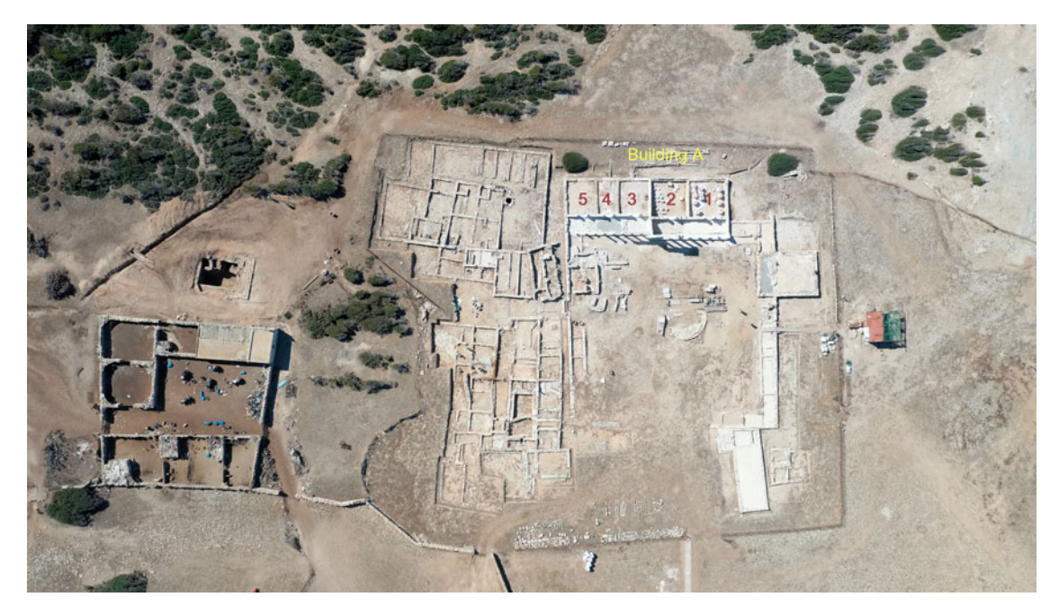
Fig. 9. Aerial photo of the temenos in 2020 (courtesy of Y. Kourayos).

the centre of the later temenos, in combination with several votive dedications, securely places the earliest secure traces of cult activity at the site in the early seventh century BC.