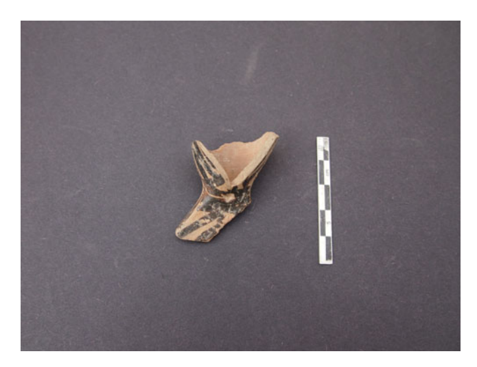
Fig. 5. Trapezoid double swallow tail of terracotta bird with suspension hole.