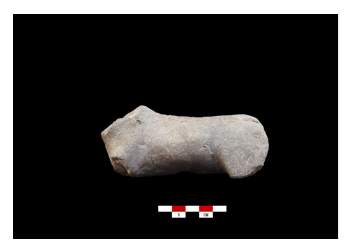
Fig. 1. Terracotta bovid.

stages in their lifecycle, needs to be carefully reassembled, before assigning them a priori religious significance. Considering them within a firm contextual frame, it is worth treating the Despotiko figurines as biographical things, whose life narrative is interwoven with human lives, actions, feelings, and memories. The biographical approach to artefacts, understood as integral to human behaviour and activity, has been increasingly employed in archaeological research during the last few decades. The emphasis has been placed either on people's material lives with the objects inseparable from their personhood and identity (e.g. Hoskins 1998; Whitley 2002) or on the social lives of the objects as shaped within different contexts (e.g. Langdon 2001; Shanks 1998). On a secondary level, the figurines – all of them animal representations in clay – should be treated as subjects, supplied with agency, for yielding possible insights into the connections between humans and the natural world.