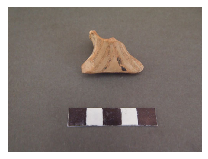
Fig. 6. Trapezoid double swallow tail of terracotta bird.

tail is decorated with horizontal bands (Fig. 7).<sup>21</sup> Were it not a bird askos, this banded tail could belong to a handmade bird, rather like the Naxian examples. We cannot conclude firmly whether or not the Despotiko birds date to the ninth century: the horizontal bands on the birds' bodies could point to a later date (e.g. Guggisberg 1996, 200, nos 677, 680, pl. 51:3).