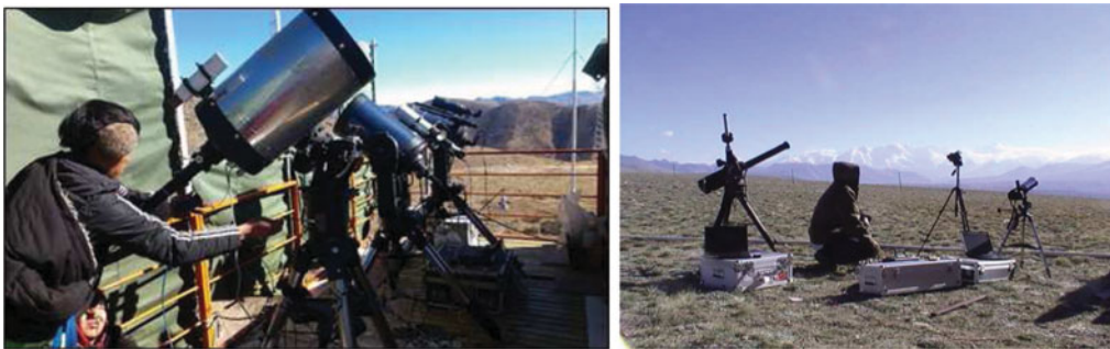
Figure 2. Professional site survey instruments after critical calibrations are used for the solar site survey.