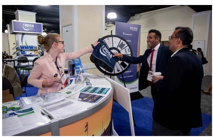
Above: Attendees spin the wheel to win swag at the APSA Lounge. Center Right: A puppy poses for a photo at the "Take a Paws" Puppy Social in partnership with the Lucky Dog Animal Rescue. Lower Right: Attendees departing the Annual Meeting on Saturday evening.