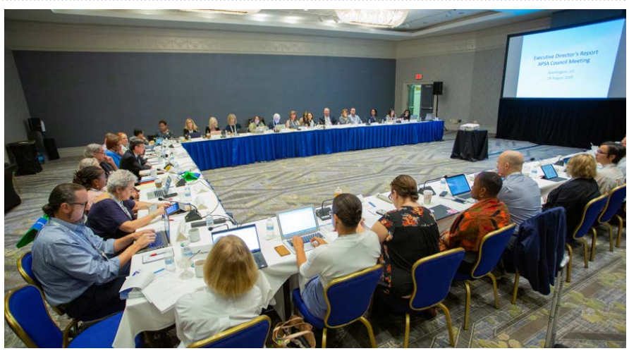
Above: The APSA Council meets on Wednesday, August 28, in advance of the annual meeting. Left: The Registration Assistance desk in the Marriott Wardman Park.

On Friday, the program chairs hosted a special panel series, "Diversity, Equity, and Inclusion in the Discipline: Shared