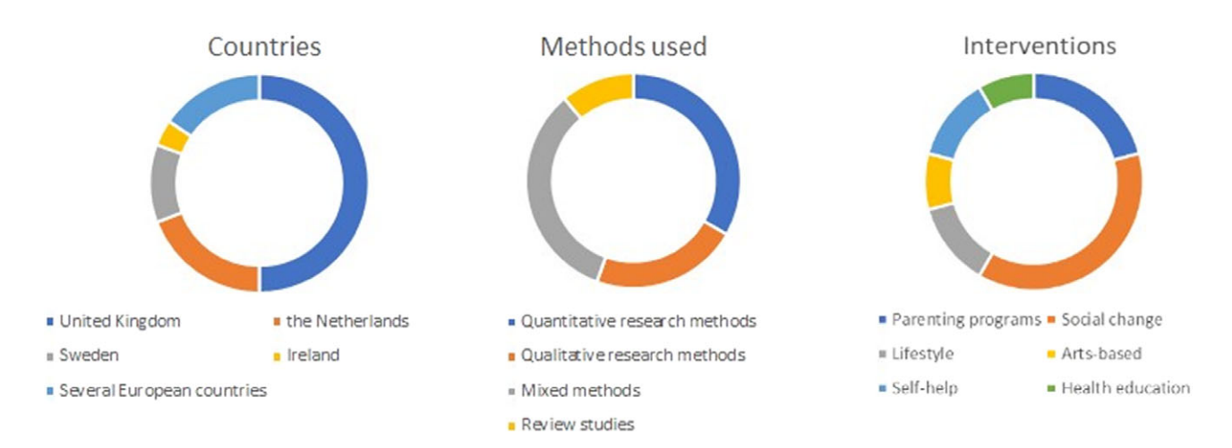
Figure 2. Countries, methods used and intervention content of the included studies.