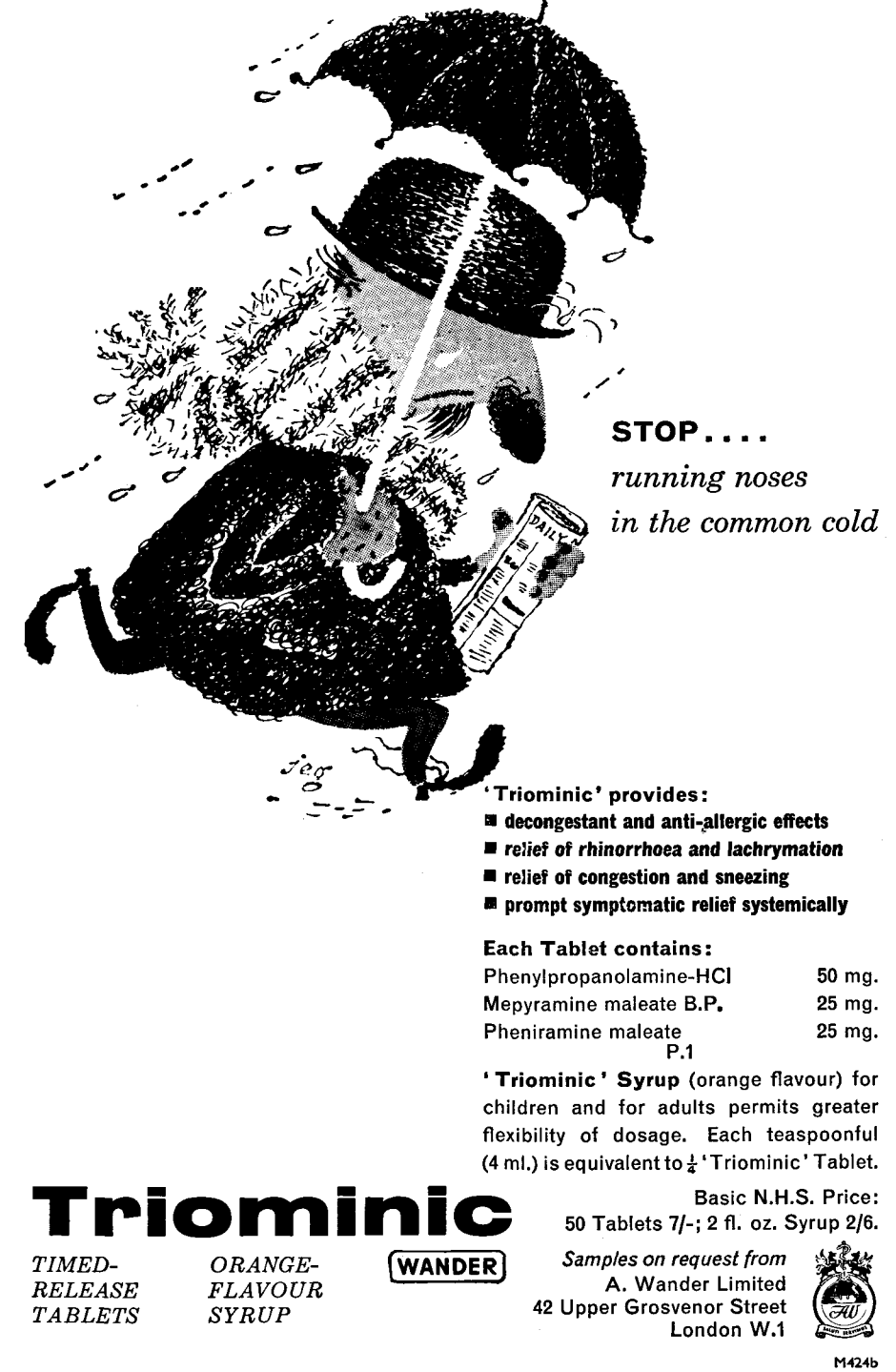
Please mention The Journal of Laryngology and Otology when replying to advertisements