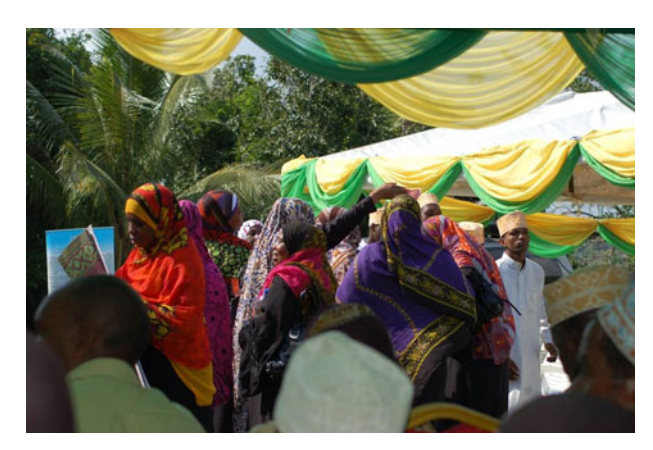
PLATE 1 The celebration for the 18 shehia with registered Community Forest Management Agreements at the close of the Hifadhi ya Misitu ya Asili programme project, attended by the President of the Revolutionary Government of Zanzibar and representatives from the Royal Norwegian Embassy and CARE International (Pemba, August 2015).

primarily from high transaction costs associated with the technical complexities of constructing cloud-free satellite images as a forest cover baseline.