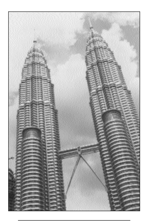
Figure 3. Petronas Twin Towers in Kuala Lumpur, Malaysia, the tallest-structure worldwide, uses concrete instead of steel as the material for the column.

Skyscrapers have always captured our imagination, and there has been keen competition among builders to make them ever taller. The tallest skyscraper, Petronas Twin Towers in Kuala Lumpur, Malaysia is unique in many respects, including the fact that concrete has been chosen instead of steel as the material for the columns (see Figure 3). New developments in the compositions of concrete, including the fly ash mentioned earlier and also microsilica and other inorganic compounds, have increased strength and reduced environmental degradation due to water seepage. The increased strength of concrete combined with its ease of construction has brought this material forward as a competitor to steel; steel has not lost the battle, though, with its improved mechanical properties and environmental compatibility. The coming years will see more and taller skyscrapers using both of these materials. Frank Lloyd Wright's dream of building a mile-high skyscraper in Chicago may still become realizable when lightweight but structurally strong composite materials start to be