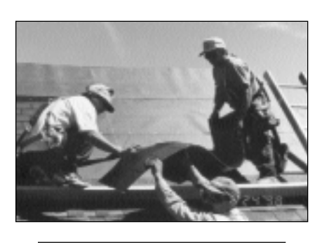
UNI-SOLAR solar shingle installation.

A few building applications of sensors will be extremely attractive in the coming decades. The first concerns their applications to the integrity of the building structure itself. For instance, properly integrated sensors could measure the corrosion of reinforcing steel bars in concrete through changes in the pH level and inject appropriate remedial chemicals to that location. Sensors may also be used to measure wind speeds or earthquake-generated pressures and provide for a temporary increase in strength at anchorage points of the roof and other vulnerable locations. Sensors and semiconductor photovoltaics can become integral parts of the structure. providing for the generation of electrical energy. While newer semiconductors are being pursued to improve the effi-