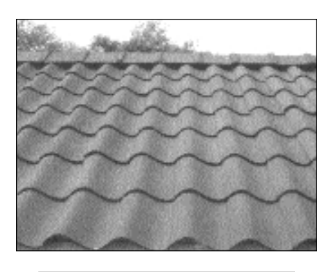
Figure 2. Composite materials, using natural fibers and agroindustrial wastes and byproducts in polymer-cement matrices, are being developed and produced in India.

The continuing practice of manufacturing building materials through indiscriminate and thoughtless felling of trees and exploitation of minerals is severely damaging the environment and destroying the forest cover. If the present rate of such practices continue, the tropical forest cover will be depleted. Many developing economies, most notably India, are therefore developing alternative materials, based on agricultural wastes and residues, natural fibers, and plantation timber, that have an added advantage of requiring less