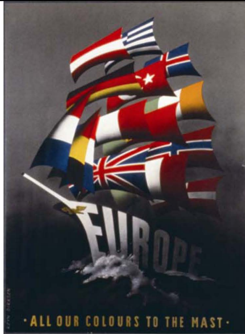
Image 1: 1950 Marshall Plan Poster Contest Winner, by Reyn Dirksen