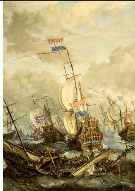
Image 2: Detail from Abraham Storck, The “Royal Prince” and other Vessels at the Four Days Battle, 1-4 June 1666 (National Maritime Museum, Greenwich, London), ca. 1670. In the foreground we see the sinking English ship.