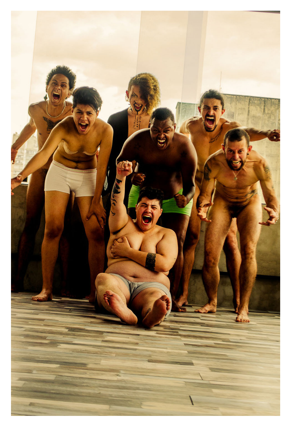
Figure I. Taken November 2017 at the Estúdio Nu (São Paulo, Brazil).