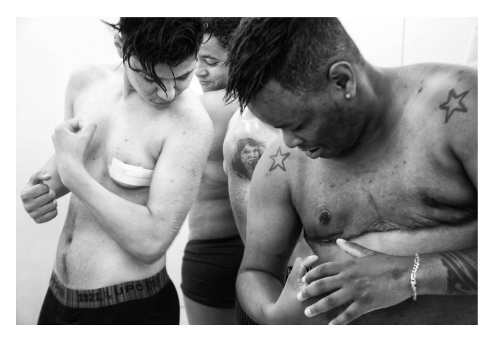
Figure 4. MBB in the vestiario. Taken July 2017 at the Sindicato dos Bancários (São Paulo, Brazil).

toxic versions of manhood are touted by Bolsonarists, who react to perceived societal degradation by arming militants (among other escalations). This image, though, presents a jocular take on "arming." The players are in their boxer shorts, with their hair still wet from the shower, yet even in this private environment they stand close to one another, bodies touching. While the MBB family is not the traditional (i.e., heteronormative) one revered by conservatives, the Meninos refuse to be less than. These images instead reveal joy and love.