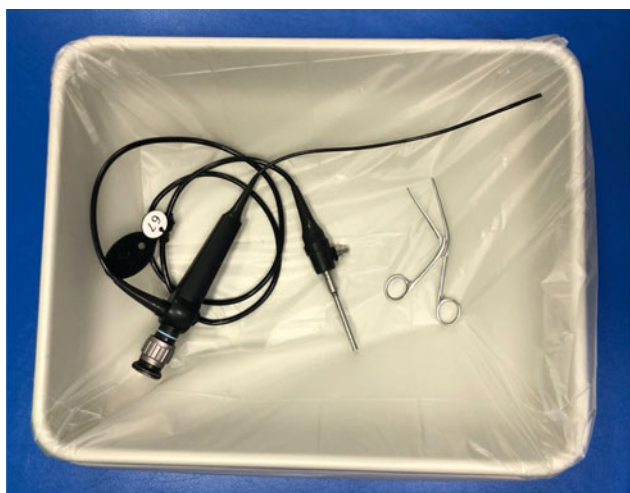
Fig. 3. Flexible nasendoscope and Tilley's dressing forceps in tray.

It must be noted that when there is likely to be a delay in specimens reaching the laboratory, the use of viral transport medium is strongly recommended by WHO. 15