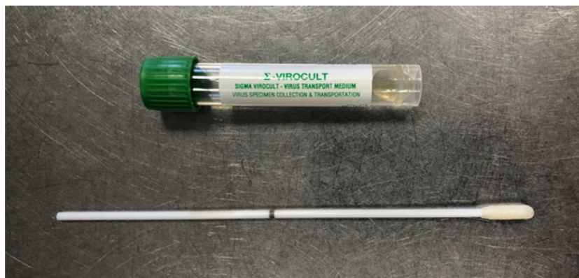
Fig. 2. Viral swab with breakpoint mechanism (black line on the swab shaft) and accompanying bottle containing virus transport medium.