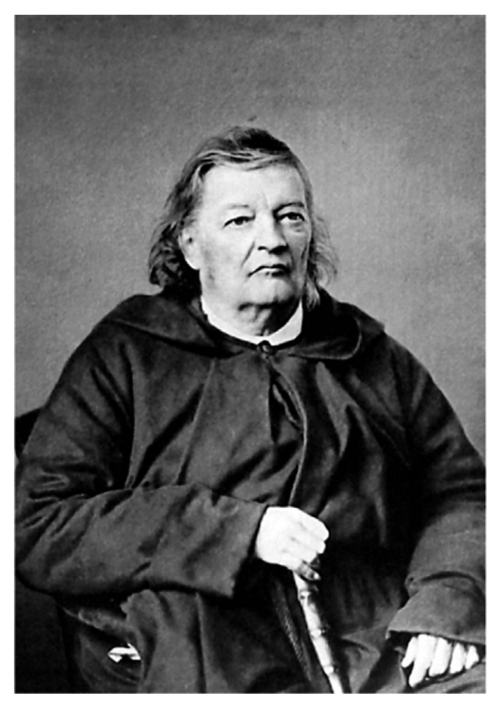
Fig. 1.1 Justinus Kerner, 1855.

Contemporaneously with Steinbuch, the 29-year-old physician and Romantic poet Justinus Kerner (1786–1862) (Fig. 1.1), then medical officer in a small village, also reported a lethal food poisoning. Autenrieth considered the two reports from Steinbuch and Kerner as accurate and important observations and decided to publish them both in 1817 in the Tübinger