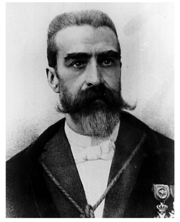
Fig. 1.3 Emile Pierre Marie van Ermengem 1851–1922.

On December 14, 1895, an extraordinary outbreak of botulism occurred amongst the 4000 inhabitants of the small Belgian village of Ellezelles. The musicians of the local brass band "Fanfare Les Amis Réunis" played at the funeral of the 87-year-old Antoine Creteur and as it was the custom gathered to eat in the inn "Le Rustic" (Devriese, 1999). Thirty-four people were together and ate pickled and smoked ham. After the meal, the musicians noticed symptoms such as mydriasis, diplopia, dysphagia and dysarthria, followed by increasing muscle paralysis. Three of them died and ten nearly died. A detailed examination of the ham and an autopsy were ordered and conducted by van Ermengem, who had been appointed Professor of Microbiology at the University of Ghent in 1888 after he had worked in the laboratory of Robert Koch in Berlin in 1883. Van Ermengem isolated the bacterium in the ham and in the corpses of the victims (Fig. 1.4), grew it, used it for animal experiments,