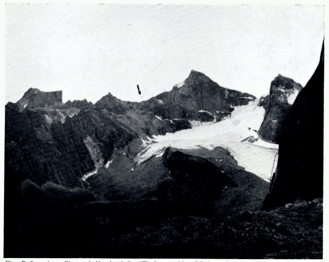
Fig. 4B. Same view as Figure 4A. Note the trimline (T), former position of the ice-cored moraine of SI (dashed line), thinning of Wichmann Glacier (arrow) and modification of the ridge tip (dotted outline). (Photograph by T. D. Hamilton, 14 August 1962; camera station 2–62)

(5) The snow line on the surface of glacier A2 appears to have moved upward more than 100 m. since 1911, but this may be largely due to differences in the dates of the comparative photographs. Smith's photographs were taken in mid-July and the writer's nearly one month later in the summer.