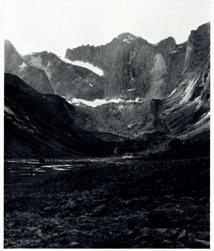
Fig. 3B. Same view as in Figure 3A. (Photograph by T. D. Hamilton, 14 August 1962, camera station 1-62)

(5) The large boulder in the stream floodplain (near left margin) has neither settled nor