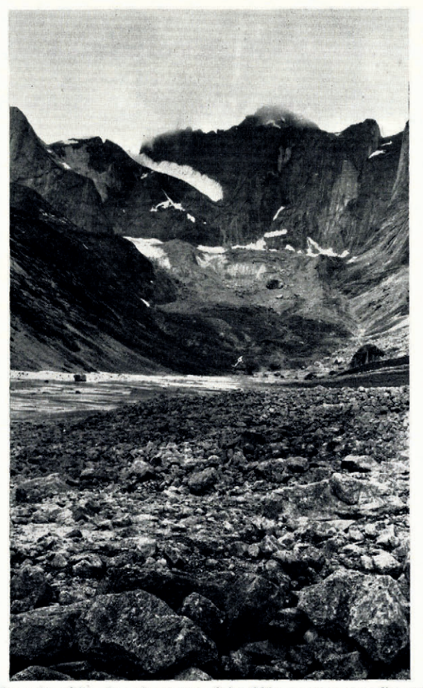
Fig. 3A. Combined terminal moraine of S2, A1 and west arm of A2. Older arcuate segment lies at the extreme front and sides; the younger component is on the circue threshold. (567, 16 July 1911)

Smith's first camera station was located on top of a prominent granite boulder c. 2 m. high which lies at about 980 m. elevation in the valley bottom near Arrigetch Creek (Fig. 2). The boulder is about 100 m. north-west of the present stream margin and c. 0.7 km. down-valley from the terminus of the recent combined moraine of glaciers S2, A1 and A2. The clarity of the foreground detail in the 1911 photographs (Fig. 3A) allowed reproduction