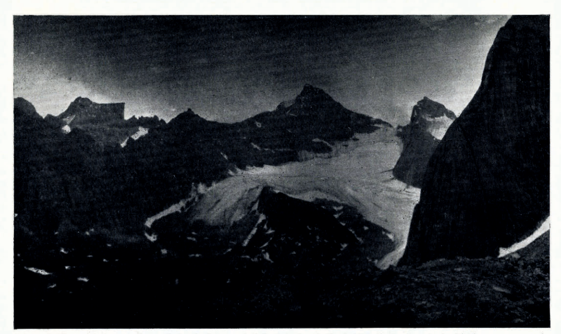
Fig. 4A. Cirque glacier complex at the head of the north fork of Arrigetch Creek. Note the ice in contact with the younger moraine substage. (Photograph by P. S. Smith; 570, 16 July 1911)

(4) The ice-cored moraine in the foreground has subsided an average of 2-3 m. from its 1911 position (dashed line, Fig. 4B). The down-slope movement of its surface boulders indicates continued spilling of boulders over the circue threshold.