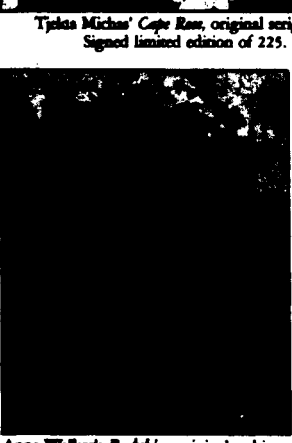
er's Berkelder, original cac