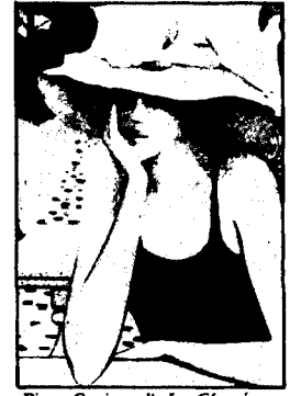
Jean-Pierre Cassigneul's Les Génesiums, original lithograph, Signed limited edition of 100.

You'll find out about the special pleasure of owning original art, instead of just visiting it.