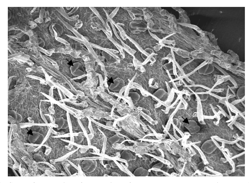
Figure 1: SEM of lower side of Vernonia leaf. Numerous glandular trichomes (arrows) appear among apparent non-glandular trichomes. Original magnification X50.