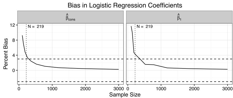
Figure 1. This figure shows the percent bias for the intercept and coefficient for x_1 . The rule of thumb requiring ten events per explanatory variable suggests a minimum sample size of about 219. For samples larger than about 250, the bias falls below three percent and it nearly disappears as the sample size approach 3,000.