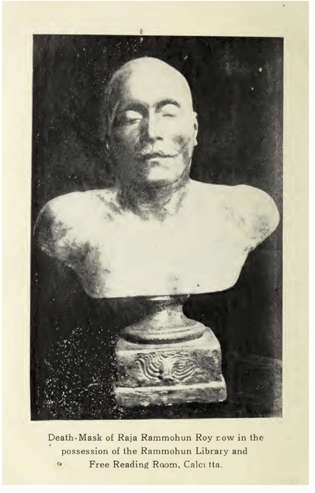
Figure 4. Mary Carpenter, The Last Days in England of the Rajah Rammohun Roy (Calcutta: Rammohun Library, 1915), xiv.

this racializing rule. He constructed a table enumerating the size of the major lumps on Roy's head, each correlating to a character trait ("cautiousness, large"; "concentrativeness, large"; "self-esteem, very large"). He then checked these measurements against Roy's biography. The "unusual volume" of his brain was racially atypical. So was the attenuated development in the cranial regions associated with "Veneration" and "Wonder" ("the two sentiments which are most influential in forming the religious character"), as befitted a rational reformer. "The mysterious and unintelligible had no charms for him: he submitted everything to the test of consistency and reason." <sup>100</sup>