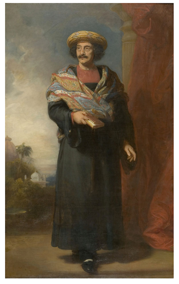
Figure 2. Briggs, Henry Perronet. Portrait of Rammohun Roy. 1832 / © Bristol Museums, Galleries & Archives / Given by Miss A. Kiddell to the Bristol Institution (forerunner of the City Museum), 1841, and transferred to Bristol Art Gallery, 1905 / Bridgeman Images.

health, or so his friends worried. An 1833 portrait by U.S. painter Rembrandt Peale seems to depict a sicklier, heavier man than Briggs had captured a year or more earlier (figure 3). ^{27}