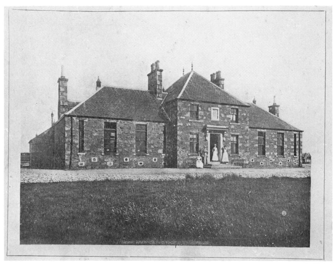
Figure 1 The Lewis Hospital, Stornoway, c. 1913.