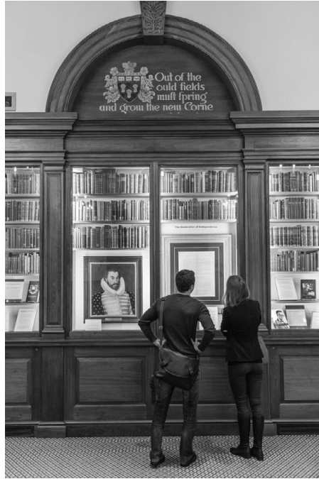
FIGURE 9.6 Bookcase in the Caspersen Room with the Royall/HLS shield. Brooks Kraft.

For out of olde felde, as men seyth, Cometh al this newe corn from yer to yere; And out of olde bokes, in good feyth, Cometh all this newe science that men lere. 95