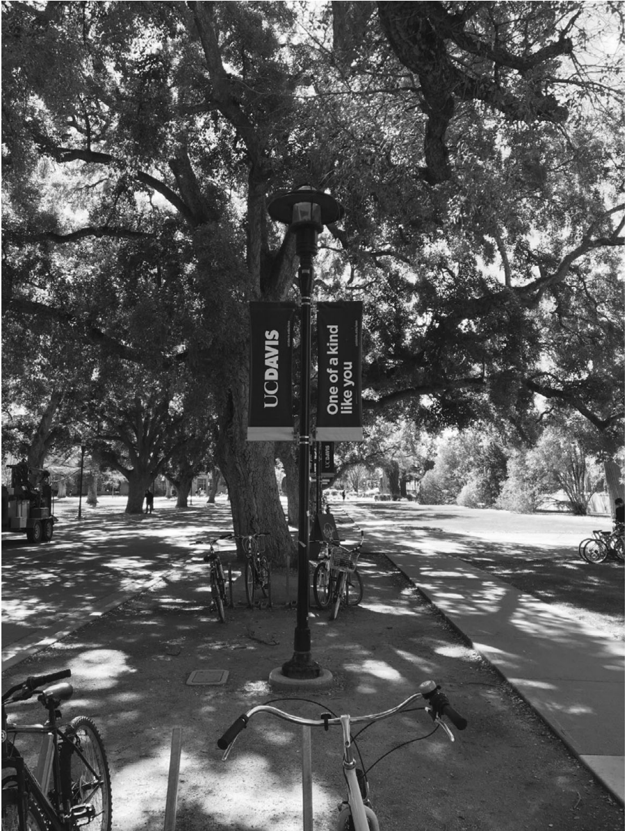
FIGURE 2.1 One of a kind like you (photo of UC Davis pennant by Celia Lury).

To add one further observation: the personalization processes described here are dependent on a process of computer-assisted data collection made possible by platformization (Gillespie 2010; Helmond 2015; Poell et al. 2019). In the case of Pythagoras the platform is Microsoft Dynamics 365, a Microsoft Power