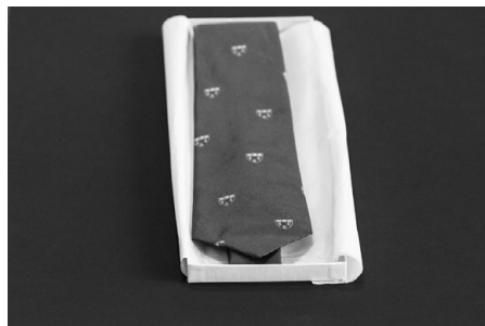
FIGURE 9.8 Wm. Chelsea LTD, Scarsdale, NY, “Harvard Law School Silk Necktie.”

lens, which had effectively erased its Royall origins. Nor did he associate the Royall Chair, which he selected for himself when he became dean, with the shield, or with slavery. During this period, I can find no inkling in the Law School’s branding landscape of a taint on the shield or its family of origin. As late as 2005, the Charles Hamilton Houston Institute for Race and Justice celebrated its grand opening brandishing the three-garbs shield (Figure 9.11). For the time being, the shield was everywhere and presumed to be benign; the Chair was the dean’s because the dean had it; and the original donor who linked them was forgotten.