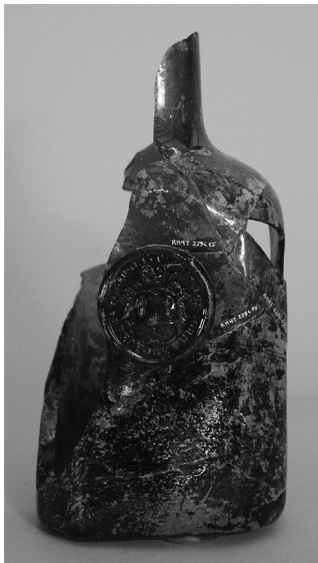
FIGURE 9.9 Glass bottle with Royall family shield.