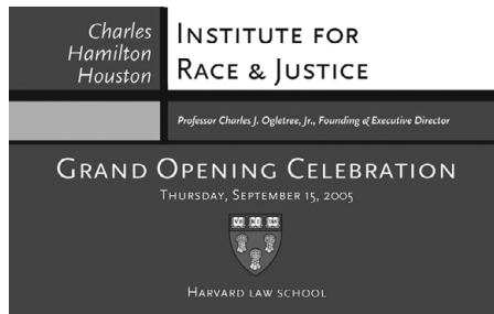
FIGURE 9.11 Charles Hamilton Houston Institute for Race & Justice Grand Opening Celebration web page. Harvard Law School.

sponsored re-enactments of high tea out on the lawn, complete with white gentlemen and ladies in elaborate colonial garb and servants in blackface (Figure 9.12). 104