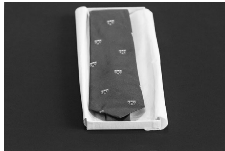
FIGURE 9.8 Wm. Chelsea LTD, Scarsdale, NY, "Harvard Law School Silk Necktie." Harvard Law School Library, Historical & Special Collections.

lens, which had effectively erased its Royall origins. Nor did he associate the Royall Chair, which he selected for himself when he became dean, with the shield, or with slavery. During this period, I can find no inkling in the Law School's branding landscape of a taint on the shield or its family of origin. As late as 2005, the Charles Hamilton Houston Institute for Race and Justice celebrated its grand opening brandishing the three-garbs shield (Figure 9.11). For the time being, the shield was everywhere and presumed to be benign; the Chair was the dean's because the dean had it; and the original donor who linked them was forgotten.