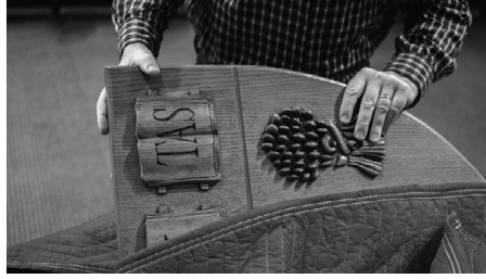
FIGURE 9.13 Removing the shield from Ames Courtroom.

as a racist by one of the protesters, in part for benefiting from the Royall Chair. Every step of the way was intensely controversial. It will be even more than usually impossible for me to be objective about what it all meant. But I'll try to write it so that those who disagree with my interpretation of it, and those who chose for themselves very different roles in it, can see it in retrospect as a story not only about social good and evil, or political wisdom and folly, but also about a brand and its mark.