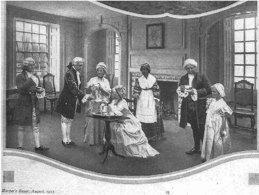
FIGURE 9.12 Tea ceremony at the Royall House. Harper's Bazaar , 1915.