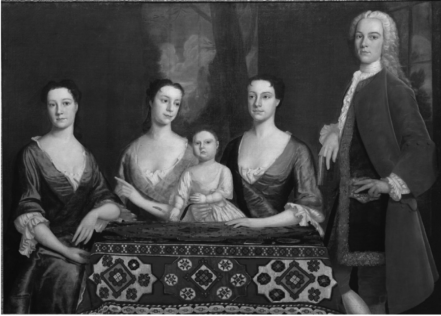
FIGURE 9.3 Robert Feke, “Isaac Royall and Family.”