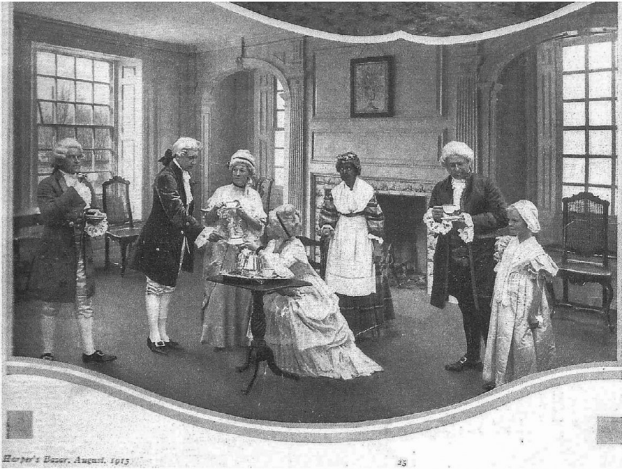
FIGURE 9.12 Tea ceremony at the Royall House. Harper's Bazaar , 1915.