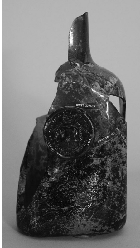
FIGURE 9.9 Glass bottle with Royall family shield. Theresa Kelliher for the Royall House and Slave Quarters.