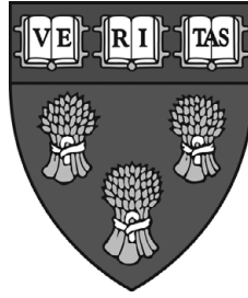
FIGURE 9.4 Royall/HLS shield. HLS retired and removed this shield in March, 2016 (see Figure 9.13).