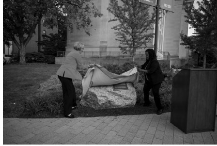
FIGURE 9.15 Drew Faust and Annette Gordon-Reed unveiling the monument in the Crossroads.