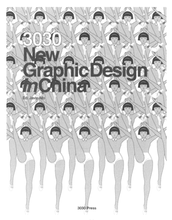
3030: New Graphic Design in China cover.

Two of these are the photographers Ren Hang (任 航) and Lin Zhipeng (林志鹏), also known by the