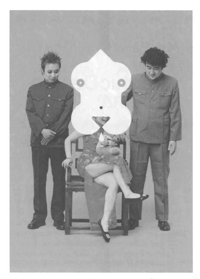
Imagine Wong, Marriage Notices (2005). Back cover art from 3030: New Graphic Design in China .

confrontational, deliberately provocative and concerned with the intensity of the moment. For such ambitious young artists, a physical book, out in the real world, is an essential accessory and an appeal for validation of the kind that no number of online 'likes' can deliver. It proclaims arrival as a serious artist, yet consistent with many of Punk's pioneers, such publications are also acts of brand management and career advancement.