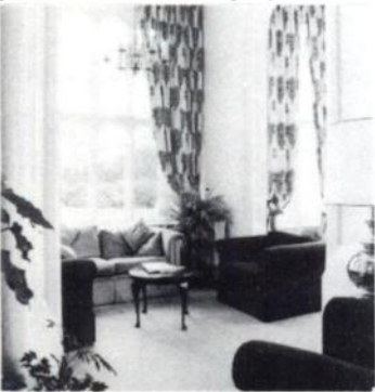
three clinically independent hospitals within the UK. Each hospital aims to provide the very best treatment.

The CPC Group, founded in 1962 and firmly established as a major private health care company, now has